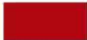
SUPER RED NGA