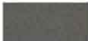
GRAY TITANIUM NDA