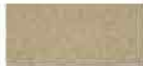
SOFT BEIGE MZ