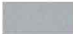
HYPER METALLIC P2S