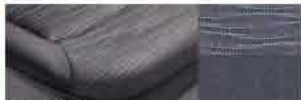
WOVEN / GRAY GL