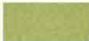
LIME GREEN NJA