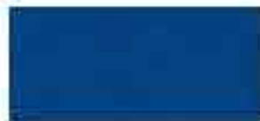
BLUE SAPPHIRE NHA