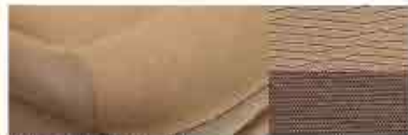
TRICOTT SUEDE / BEIGE GLS