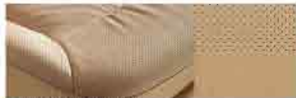
LEATHER / BEIGE GLS / OPTION