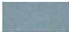
BLUE DIAMOND NEA