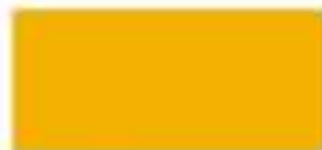
DYNAMIC YELLOW NFA