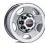
QB5 ❑ 16" 8-LUG GRAY-PAINTED STEEL ❑ STANDARD: 2500 / 3500 SERIES LS OR LT TRIM