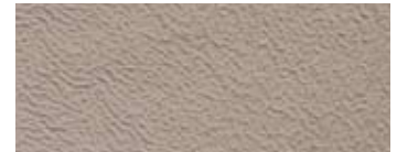
NEUTRAL Not available with Silver Birch Metallic