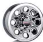
PY9 ❑ 17" 6-LUG CHROME-STYLED STEEL ❑ AVAILABLE: 1500 SERIES