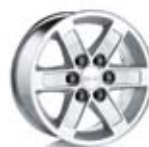
N88 ❑ 17" 6-LUG POLISHED ALUMINUM SPORT ❑ AVAILABLE: 1500 SERIES