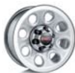
NX7 ❑ 17" 6-LUG GRAY-PAINTED STEEL ❑ STANDARD: 1500 SERIES LS TRIM