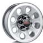
P03 ❑ 17" 6-LUG GRAY-PAINTED STEEL WITH CHROME CENTER CAP ❑ STANDARD: 1500 SERIES LT TRIM ❑ AVAILABLE: 1500 SERIES LS TRIM