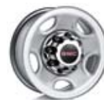
P03 ❑ 16" 8-LUG GRAY-PAINTED STEEL WITH CHROME CENTER CAP ❑ AVAILABLE: 2500 / 3500 SERIES LS OR LT TRIM