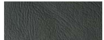
MEDIUM PEWTER Not available with Sand Beige Metallic